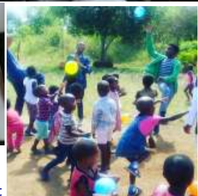
Grass study at Malolotja and Community service at Maphiveni