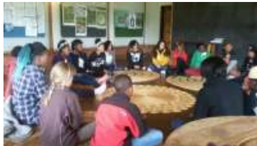
The school spirit and our motto "hand-in-hand we learn" is evident when walking around everyday in our school environment.

We are a community of individuals – although we work as a community, children are also expected to produce individual projects. They take responsibility for their own education and research and are encouraged to be unique and creative. We find that allowing children to make their own choices from a number of options keeps their interest levels high and keeps them motivated.